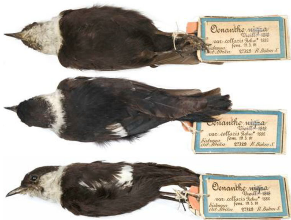
Fig. 2 Type of Myrmecocichla collaris housed in the Museum für Naturkunde, Berlin (Cat. No. 27329, adult female).

Since the publication of Neunzig's (1926) paper on Myrmecocichla nigra and arnotti , scattered observations and collections have been made of the white-collared form. Surprisingly, in all cases, the conjecture has been that white-cheeked/collared birds were aberrant specimens. For example, eight specimens in the British Museum of Natural History at Tring, were observed to have white cheeks [91.6.25.1.(19.1), 1934.10.19.-55 (19.1), 1909.12.31.167. (19.1), 1947.5.29 (19), 1945.34-210 (19), 1939.5.9-18 (20), 99.3.1.92 (20), 1931.12 0.21.64 (20)]. None of these specimens had complete white collars, and, interestingly, label dates indicate that they were probably sub-adult birds taken when full plumage characteristics of collaris would not have been complete. All eight specimens were collected in south-central Tanzania, northern Zambia, and the Albertine Rift, and therefore agree with our findings of this western variation. Other interesting examples are the collection of a white-collared bird from Kagera, in the Kivu Region (AMNH 582811) of the Albertine Rift, as well as a specimen collected more recently from Lwiro, Southern Kivu Province, Democratic Republic of the Congo (FMNH 438821).